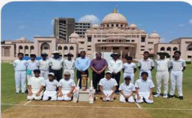
SGVP trophy All India Cricket tournament for boys under-12

Reliance Youth Sports Football Tournament Boys Under-14 was held at SGVP International School, Ahmedabad on November 24, 2022 in which 32 teams participated. All the players played with great zeal.